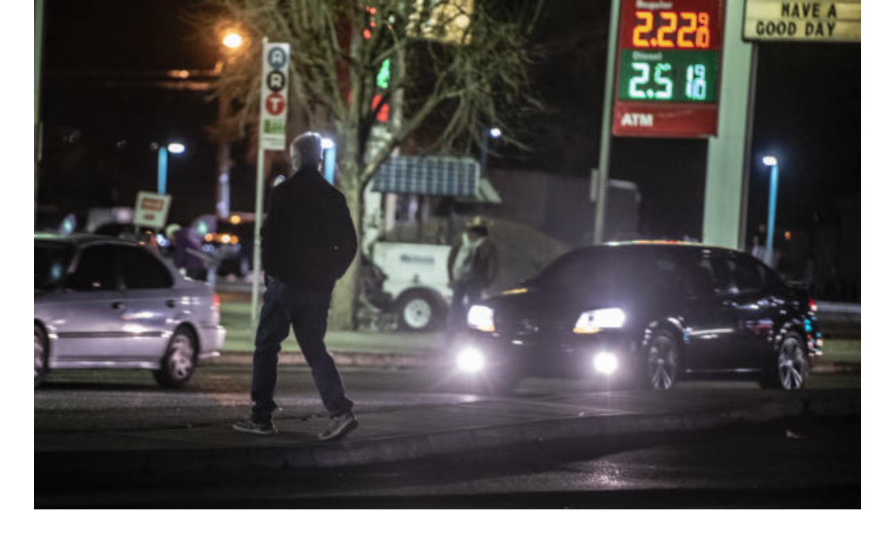
A man jaywalks on Thursday evening near Wyoming and Central.

The uptick in such fatal crashes in Albuquerque comes on the heels of local officials signing onto a national initiative to make streets safer for pedestrians and cyclists. As part of that effort they have lowered speed limits in one part of town, assessed school crosswalks and are gearing up to pump legislative money into infrastructure citywide.